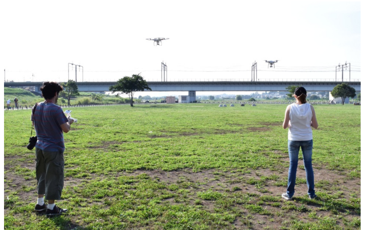
image1: Players ready to race

Through the HMD the First-Person View from drones' cameras is provided to the players, giving the feeling of flying and experiencing the thrill of the race.